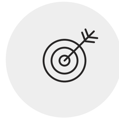
Hitting the Brief